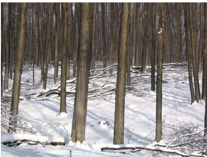
Recently thinned northern hardwood stand